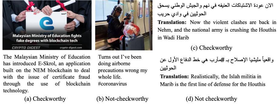
Figure 2: Examples of tweets with their check-worthiness labels.