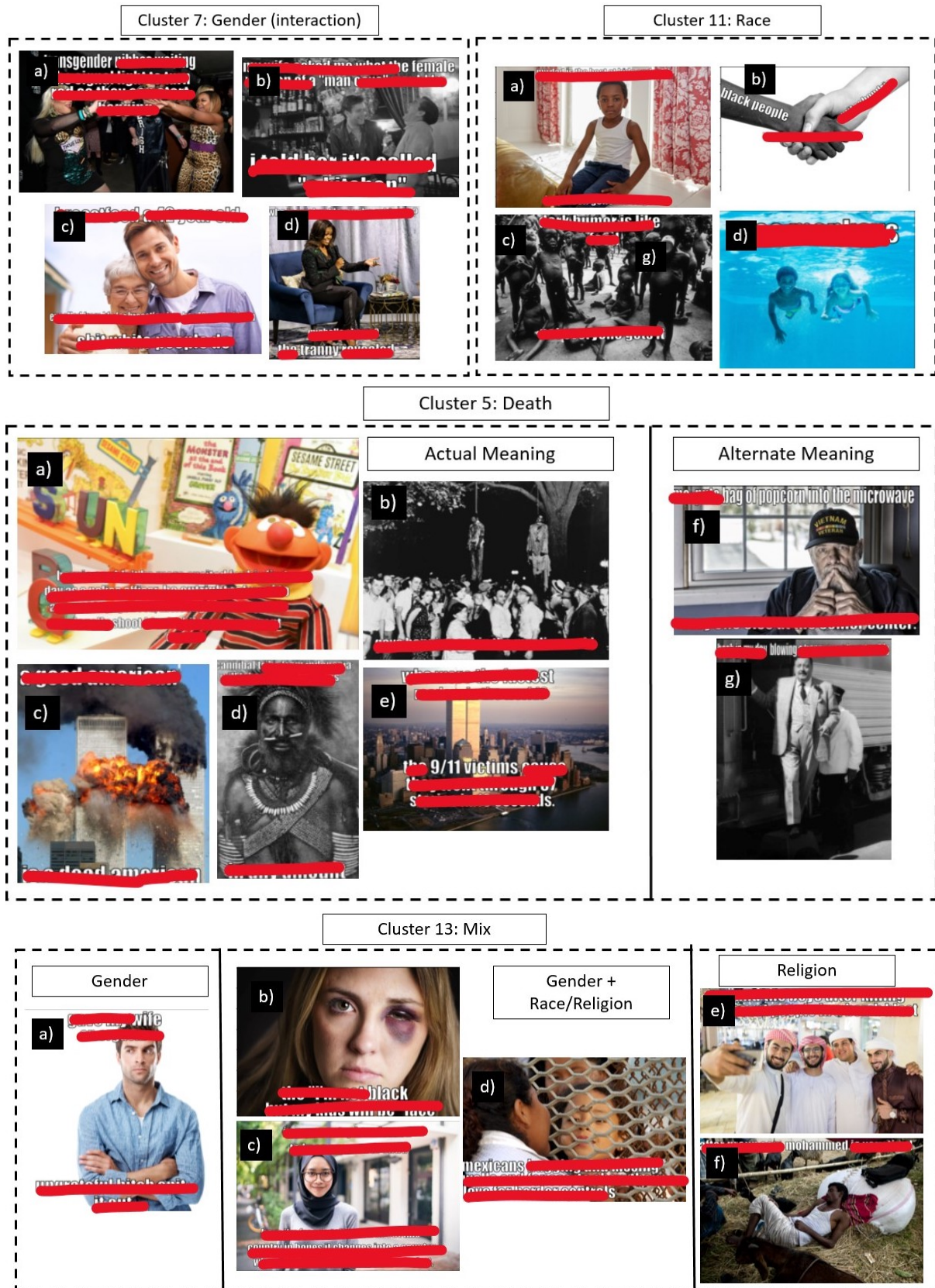
Figure 3: Hateful memes clustered by K-means clustering algorithm (number of clusters = 15) based on the trigger vector of Hate-CLIPper with cross-fusion. Featuring hateful examples with all the original text in this place would be distasteful; hence the meme text is masked with the exception of few words that are required for discussion. However, the reader can choose to look at the non-censored memes in the appendix