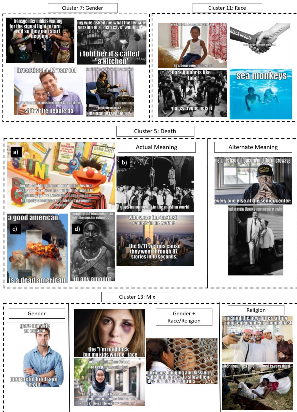
Figure 4: Hateful memes clustered by K-means clustering algorithm (number of clusters = 15) based on the trigger vector of Hate-CLIPper with cross-fusion. This non-censored version is just for more understanding and the reader can choose to skip this figure as it features distasteful content.